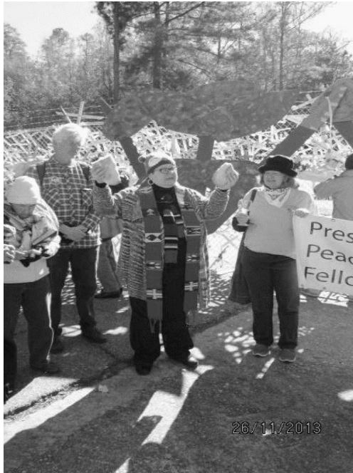
Communion service at the gates of Ft. Benning

For the 17 th straight year, the Presbyterian Peace Fellowship participated in the November rally and vigil at the gates of Fort Benning to call for closing the School of Americas/WHINSEC. The weekend was filled with vibrant witness as the gathering of thousands participated in both traditional and creative new actions.