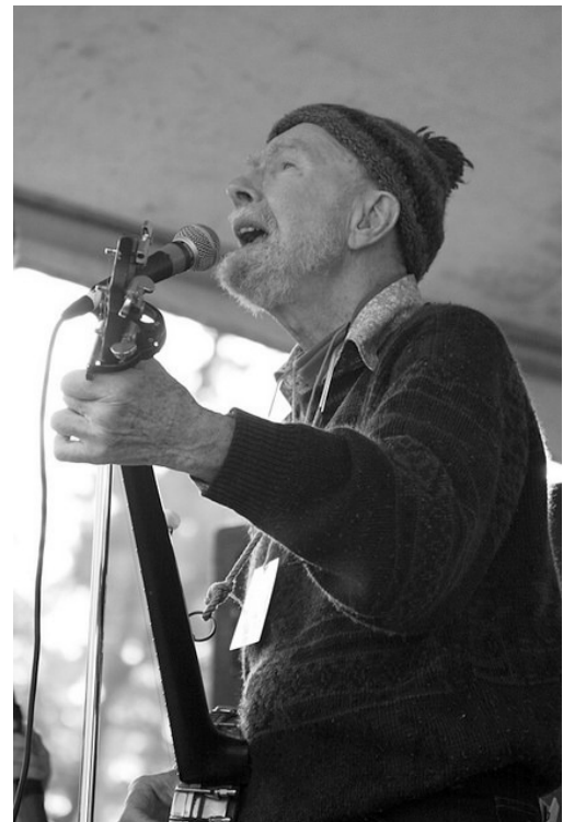
Pete Seeger performed often at SOA Watch vigils at Ft. Benning.

On Sunday, November 24, thousands walked in a solemn funeral procession and commemorated those who have been killed by SOA/ WHINSEC graduates and U.S. militarization. The procession transitioned into an upbeat celebration of life and resistance, after Oscar Romero's last sermon was blasted through the stage speaker system, and a banner with our message and thousands of soap bubbles crossed over the barb-wired fence. None of the bubbles were arrested for crossing onto the base.