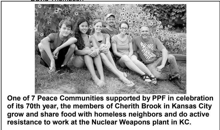
One of 7 Peace Communities supported by PPF in celebration of its 70th year, the members of Cherith Brook in Kansas City grow and share food with homeless neighbors and do active resistance to work at the Nuclear Weapons plant in KC.